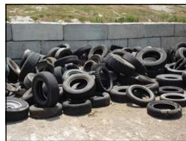
Waste tires picked up from Lompoc residents on Tire Roundup Day.

Did you know Californians discard an estimated 40 million waste tires each year? In an effort to promote waste tire recycling, and reduce the amount of illegal dumping, the City is conducting a Waste Tire Roundup Day.