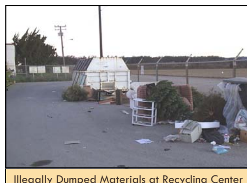
Illegally Dumped Materials at Recycling Center

In order to prevent a few bad apples from ruining the bunch, the City has recently installed surveillance cameras at the Center. The cameras are intended to serve as a deterrent to illegal dumping and scavenging of recyclable materials. In addition, they will enable the City to hold illegal dumpers responsible for their actions. Collection staff hopes that the eventual reduction in illegal dumping will free up more personnel hours to focus on services (i.e., container repairs, street sweeping, etc.) provided to Lompoc customers.