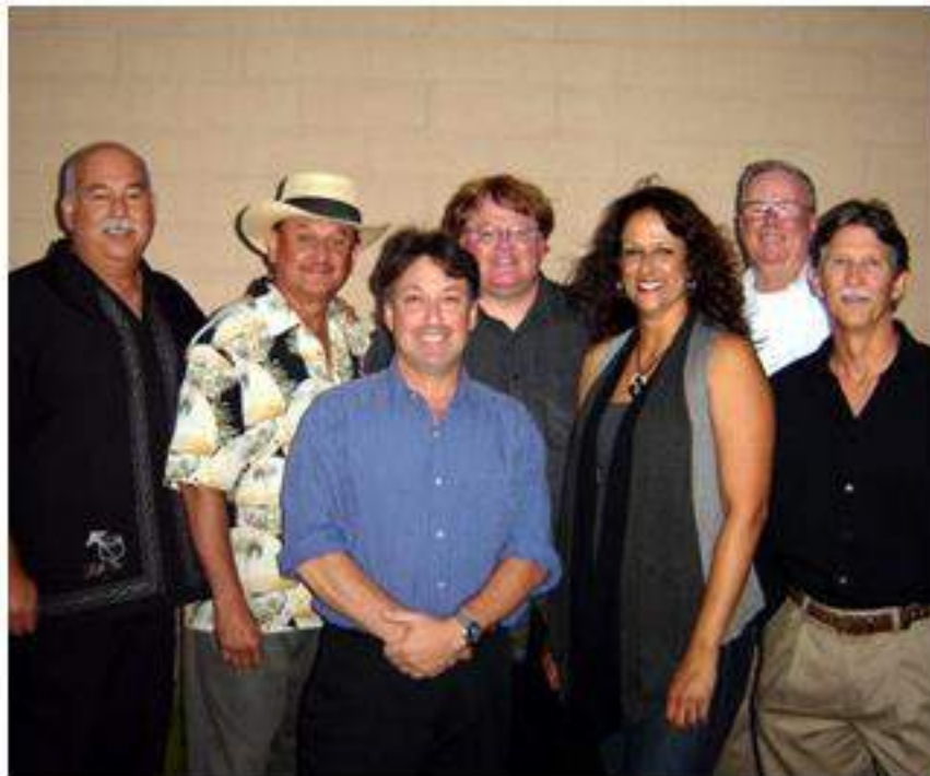
HARD TIMES GOOD TIMES

DOWNLOAD APPLICATION AT WWW.LOMPOCPD.COM OR CALL 805-875-8108